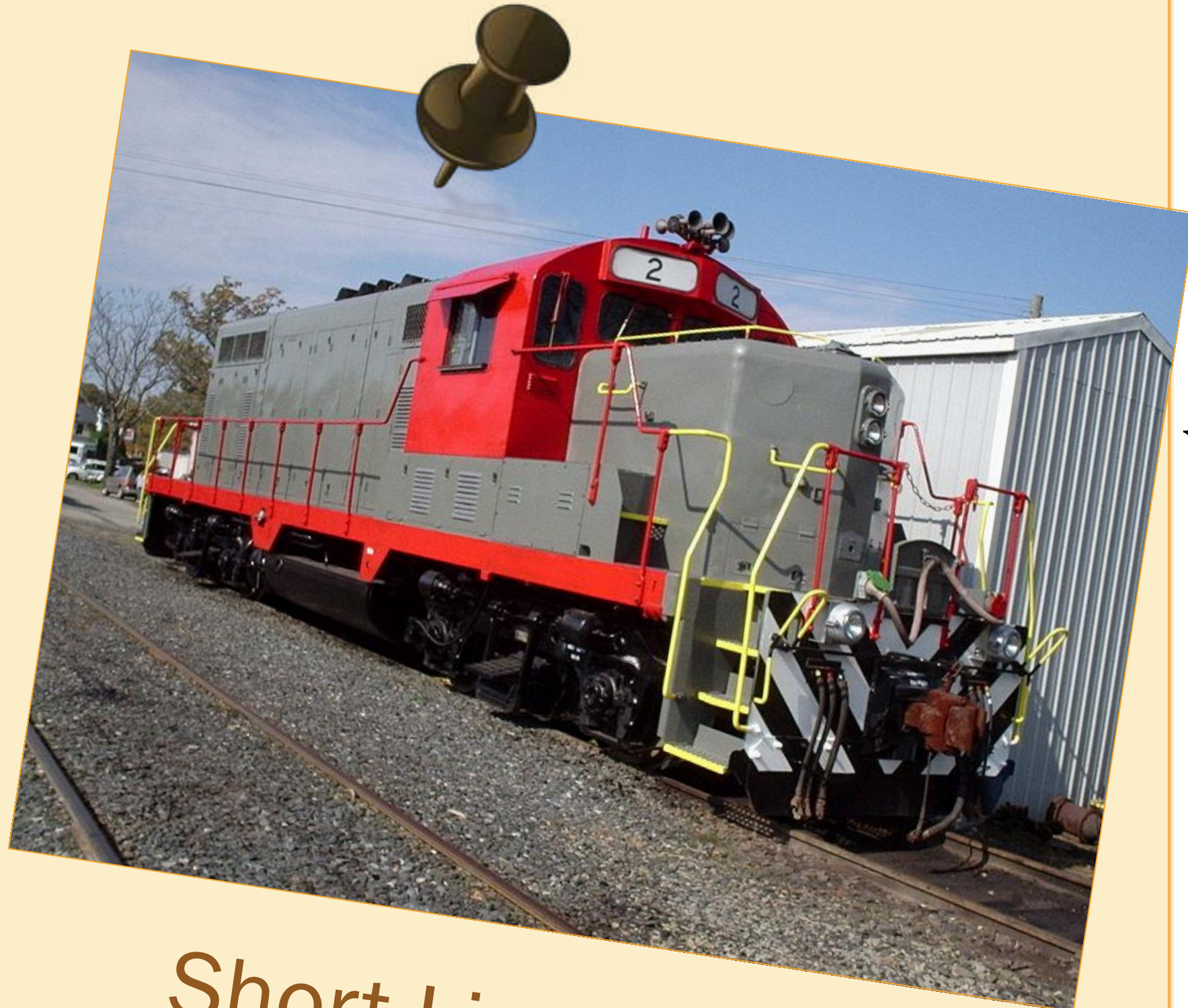
Short Line Train