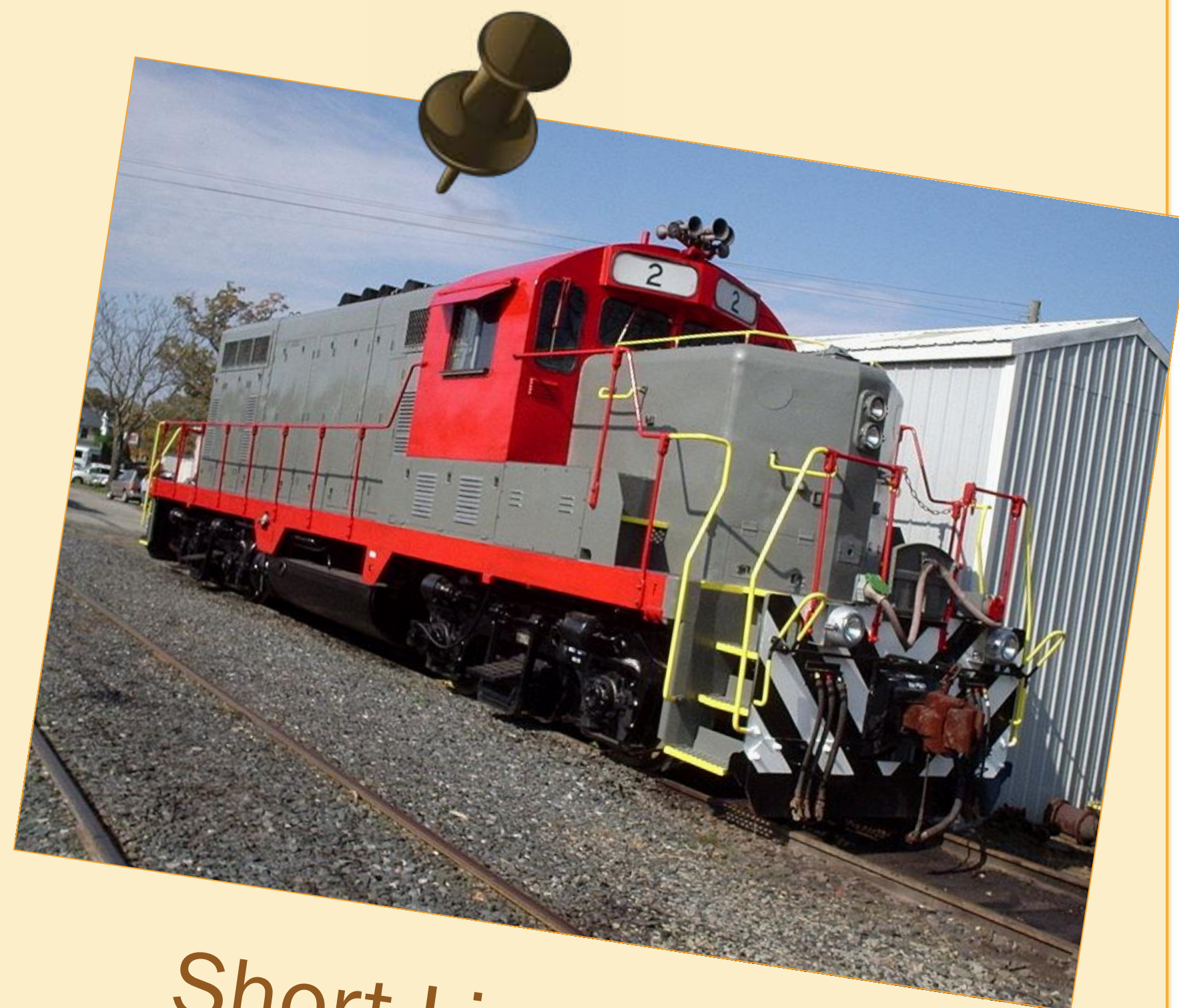
Short Line Train