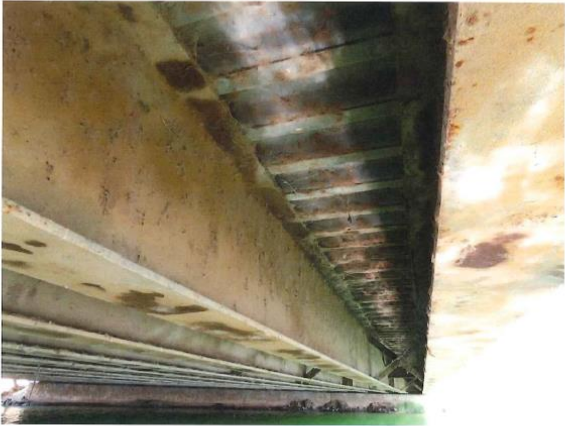
File Name: 00481-2021-08-30-Photo-4.JPG